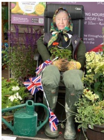
One of the fantastic scarecrow's from the Queen's Jubilee

Let 's brighten up the village and create lots of royalty-themed scarecrows to display in your front gardens over the Bank Holiday weekend Saturday 6th - Monday 8th May. This is not a competition and your creations will not be judged ...but much admired!